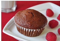
Choc. Chip Muffin